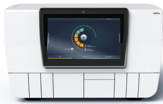
Figure 1. The AS T ar System covers the broadest Gram-negative antimicrobial panel and range of dilutions to date, in a user-friendly and fully automated rapid AST system. The instrument is designed to deliver AST testing from positive blood cultures in ~6 hours.

The AS T Disc contains more than 330 culturing chambers prefilled with antimicrobials in various concentrations used for AST, chambers without antimicrobials used as controls, and chambers used to determine the concentration in the purified sample. The Disc is labeled with a unique barcode for identification, and linking to each respective sample preparation Cartridge and patient. The antimicrobial panel for AST analysis of Gram-negative bacteria includes testing capacity for both non-fastidious and fastidious pathogens, directly from positive blood cultures. The availability of a broad panel with “old” and “novel” antibiotics offers multiple therapeutic options, while preserving the efficacy of new molecules. The optimal design allows for Disc storage at room temperature.