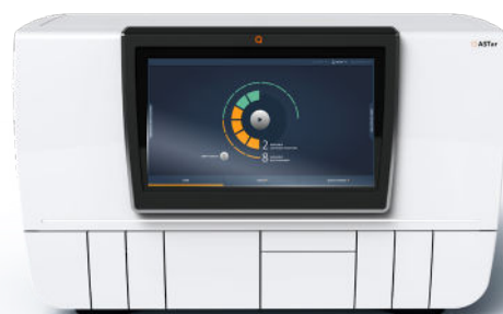
Figure 1. The ASTar System covers a broad antimicrobial panel and range of dilutions. Packaged in a user-friendly and fully-automated rapid AST platform, the instrument delivers AST reports in ~6 hours.

ASTar overcomes this inoculum effect by measuring actual bacterial content during sample preparation and consistently generating final inoculum concentrations that fall within EUCAST and CLSI guidelines. This enables high reliability and repeatability for each sample run. Samples can be tested up to 16 hours after signalling positive with retained performance 9 .