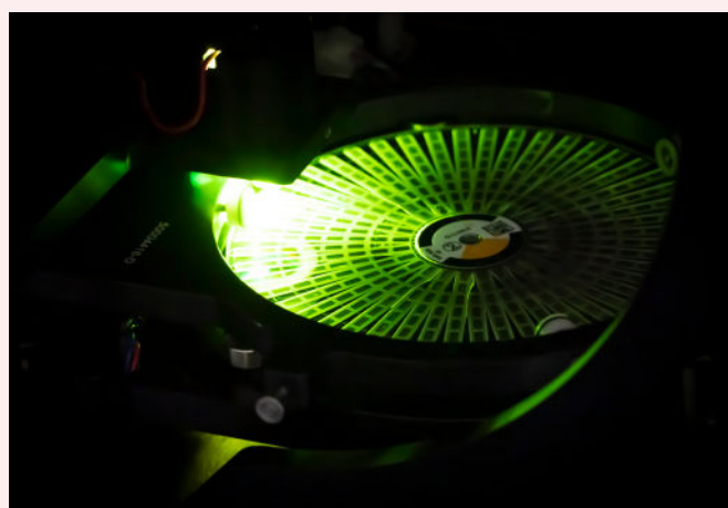
Figure 2. The Disc during AST reading. The unique proprietary technology allows automated time-lapse imaging of bacterial population growth in chambers containing different concentrations of antimicrobial agents.

The Disc design accommodates a testing capacity ranging from very low to very high MIC values. All dilutions are measured simultaneously at each time point, thereby removing the need for extrapolated values and instead reporting true MIC. The comprehensive MIC-driven optimal dosing regimen guided by ASTar can reliably support the prescription of appropriate treatments.