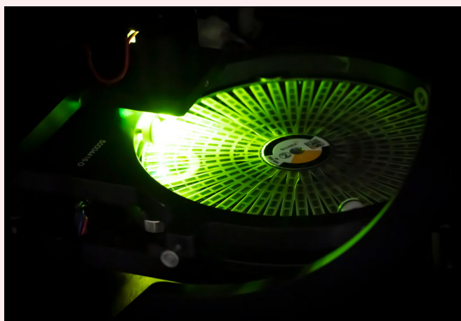
Figure 2. The Disc during AST reading. The unique proprietary technology allows automated time-lapse imaging of bacterial population growth in chambers containing different concentrations of antimicrobial agents.

The Disc design accommodates a testing capacity ranging from very low to very high MIC values. All dilutions are measured simultaneously at each time point, thereby removing the need for extrapolated values and instead reporting true MIC. The comprehensive MIC-driven optimal dosing regimen guided by ASTar can reliably support the prescription of appropriate treatments.