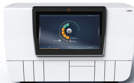
Figure 1. The ASTar System covers a broad antimicrobial panel and range of dilutions. Packaged in a user-friendly and fully-automated rapid AST platform, the instrument delivers AST reports in ~6 hours.

ASTar overcomes this inoculum effect by measuring actual bacterial content during sample preparation and consistently generating final inoculum concentrations that fall within EUCAST and CLSI guidelines. This enables high reliability and repeatability for each sample run. Samples can be tested up to 16 hours after signalling positive with retained performance 9 .