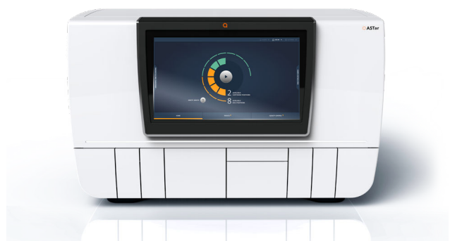
Figure 1. The ASTar System covers a broad antimicrobial panel and range of dilutions. Packaged in a user-friendly and fully-automated rapid AST platform, the instrument delivers AST reports in ~6 hours.

ASTar overcomes this inoculum effect by measuring actual bacterial content during sample preparation and consistently generating final inoculum concentrations that fall within EUCAST and CLSI guidelines. This enables high reliability and repeatability for each sample run, supporting clinical decision-making. Samples can be tested up to 16 hours after signalling positive with retained performance 9 .