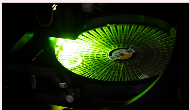
Figure 2. The Disc during AST reading. The unique proprietary technology allows automated time-lapse imaging of bacterial population growth in chambers containing different concentrations of antimicrobial agents.

There is room to add additional types of antimicrobials in the future, without the need to remove any of the existing antimicrobials. The Disc design accommodates a testing capacity ranging from very low to very high MIC values. All dilutions are measured simultaneously at each time point, thereby removing the need for extrapolated values and instead reporting true MIC. The comprehensive MIC-driven optimal dosing regimen guided by ASTar can reliably support the prescription of appropriate treatments. Broad panel coverage increases the likelihood that clinically relevant treatment options are available in the initial AST report, reducing delays associated with follow-up testing.